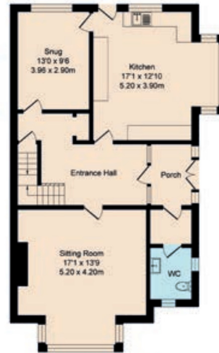
Ground Floor Approx. Floor Area 983 Sq.Ft (91.3 Sq.M.)