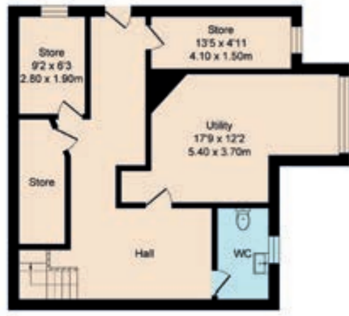
Lower Ground Floor Approx. Floor Area 687 Sq.Ft (63.8 Sq.M.)

and drawn by Lens Media for illustrative purposes only. Not to scale. Whilst every attempt was made to ensure the accuracy of the floor all measurements are approximate and no responsibility is taken for any error.