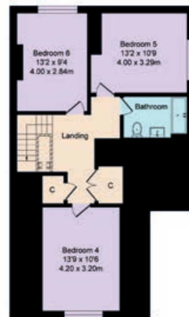
Second Floor Approx. Floor Area 653 Sq.Ft (60.7 Sq.M.)