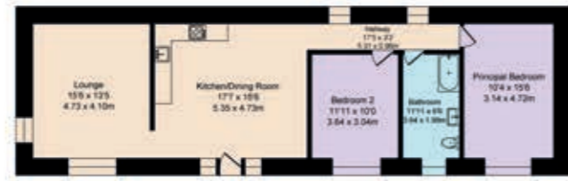
Cottage Approx. Floor Area 525 Sq Ft (48.9 Sq M.)

Surveyed and drawn by Lara Media for illustrative purposes only. Not to scale. Whilst every attempt was made to ensure the accuracy of the floor plan, all measurements are approximate and no responsibility is taken for any error.