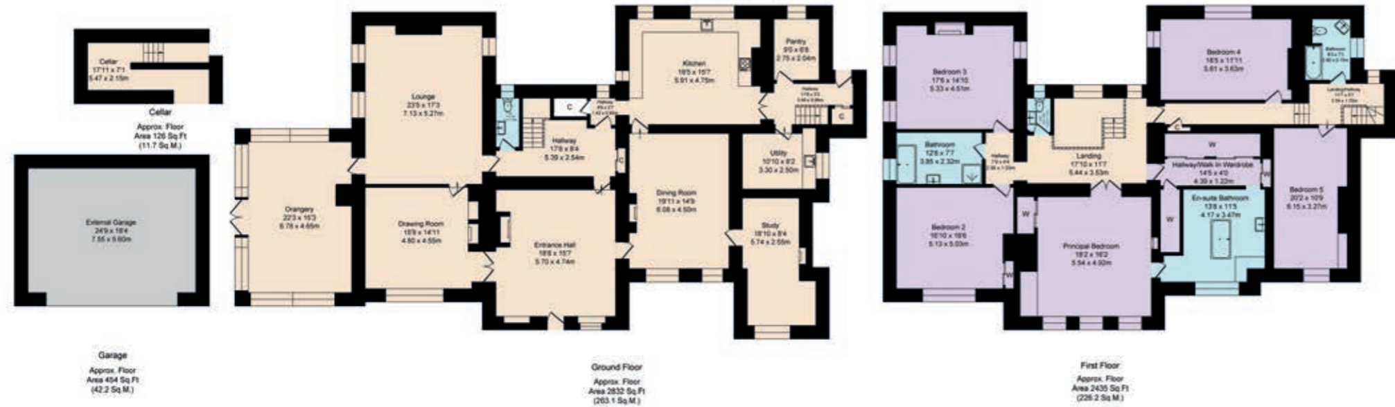
Ground Floor Approx. Floor Area 2832 Sq Ft (263.1 Sq M.)